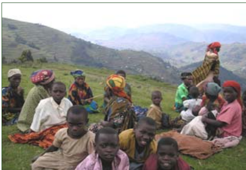
Community meeting, Murubindi, Uganda.

The Bwindi, Mgahinga and Echuya forests in south-western Uganda were gazetted as forest reserves by the British in the 1930s. This effectively protected them from being destroyed by the agriculturalists who had moved into the area formerly inhabited only by the Batwa, while allowing the Batwa to continue to make use of them. However, since Bwindi and Mgahinga became national parks in 1991, Batwa exclusion has been