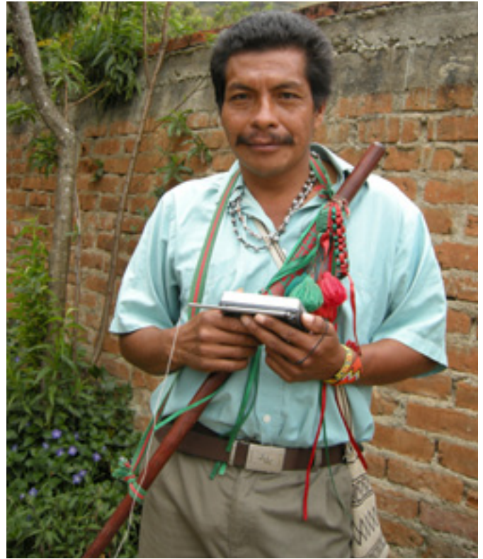
Member of the Indigenous Guard, Cauca Department

One such example can be found in the Department of Cauca, where the Nasa have organized the Indigenous Guard to peacefully protect their community against armed incursions.