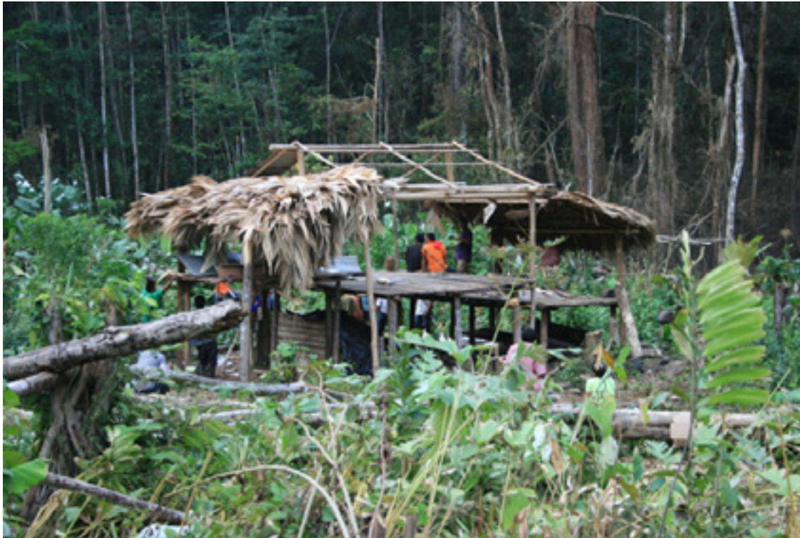
A house 'deara dee' demonstrating the living conditions of the Emberá Katio Indigenous Peoples in the Alto Guayabal

National Indigenous Organisation of Colombia (ONIC)